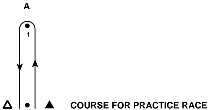
ILLUSTRATION B COURSE PATTERNS